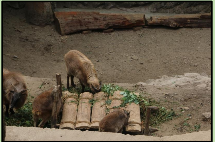
Repairing of feeding platform in Herbivore enclosure