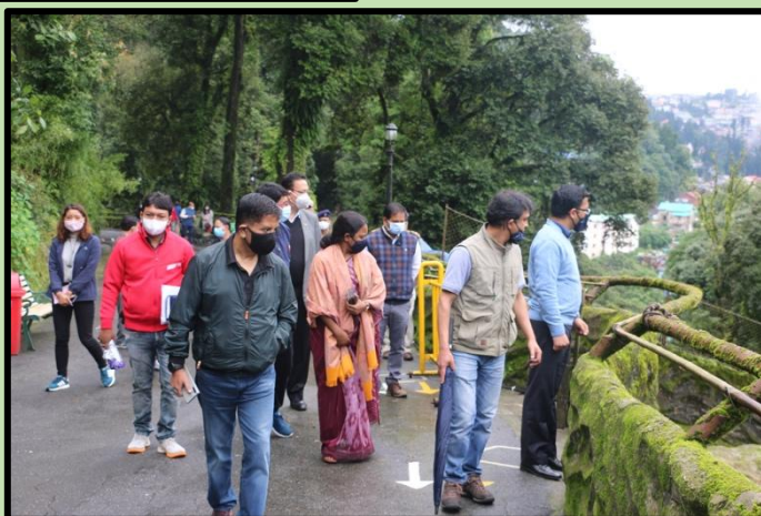
Visit of Minister of State