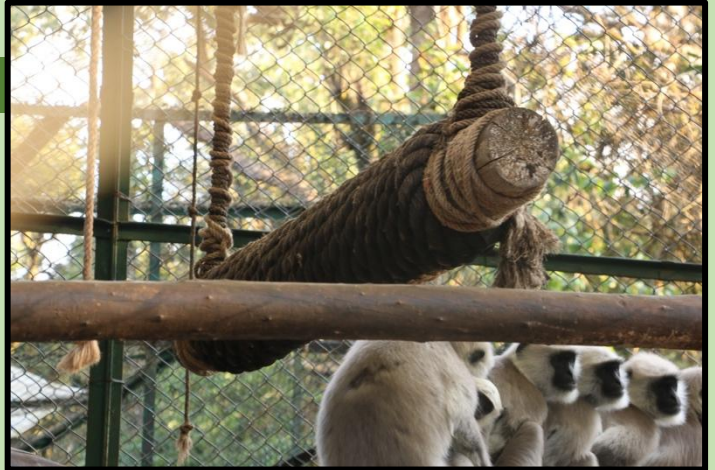
Hanging platform for Langur enclosure